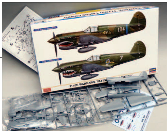
The Hasegawa P-40E combo kit comes complete with two 1/72 scale model aircraft in Flying Tigers camouflage schemes.

Hasegawa has released its 1/72 P-40E "Flying Tigers" Combo (#HSGS2082). In the years leading up to World