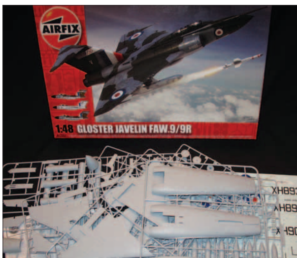
The Airfix Gloster Javelin builds into a large model that features Firestreak missiles and decals for three aircraft.

The kit features engraved panel lines and finely molded surface details, with full length intake ducting which fits within the wing spars. The kit also has options for open or closed canopies, raised or lowered wing flaps and airbrakes, as well as raised or lowered landing gear. The kit includes four nicely detailed Firestreak missiles with separately molded clear heads, as well as four drop tanks. The kit also comes with illustrated instructions, painting and decal placement guides, along with Cartograf decals for three different aircraft in two paint schemes.