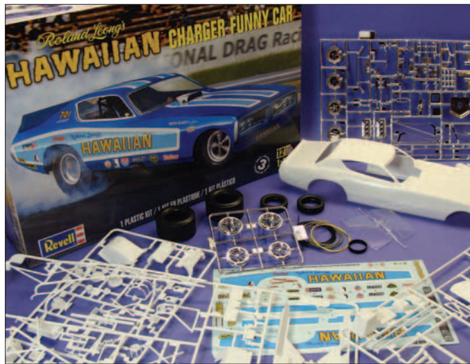
The Revell Hawaiian Charger Funny Car features a lift-up body exposing a massive 426ci blown Chrysler engine and it includes all of the detail parts a model needs to replicate this historic racer.

and clear plastic, including the base and display stand. The parts feature engraved panel lines and molded surface detail for a realistic look. The base has ground texture, rubble and skulls, as well as the molded nameplate for the commonly abbreviated movie title. The kit comes with illustrated instructions, with painting guide, and indicates that the parts are ABS plastic, rather than the usual styrene, and also recommends the types of cement that are compatible.