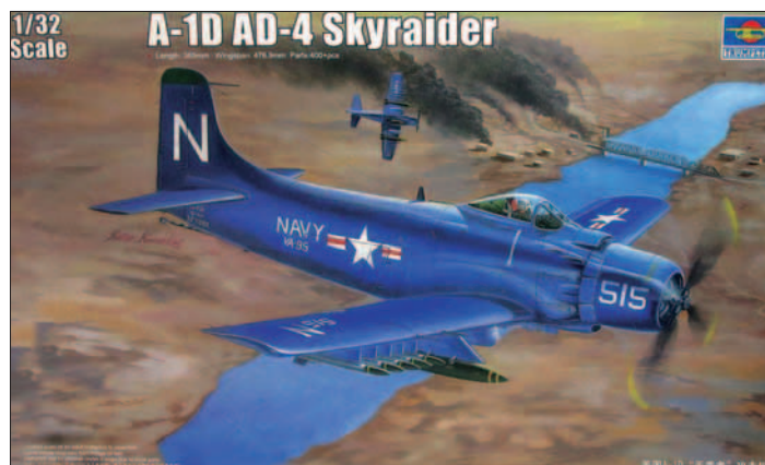
At 1/32 scale, the Trumpeter A-1D AD-4 Skyraider is a large model that is bursting at the seams with a number of intricate details.

Trumpeter 1/32 A-1D AD-4 Skyraider. The Douglas A-1 Skyraider was a large aircraft, capable of carrying up to 8000 pounds of externally mounted ordinance and delivering its weapons with precision. The Skyraider was originally designed during WW II as a single seat low-wing torpedo-bomber, but arrived too late to see action. Later it was used for ground attack, bombing, night-attack, Airborne Early Warning, target towing and many more duties. Used by the US Navy, Marine Corps, and later the US Air Force, the Skyraiders flew missions in Korea and Vietnam, but were eventually being phased