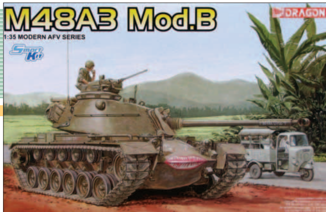
Dragon has released a 1/35 model of the M48A3 Patton, the last of the battle tanks to bear the famous general's name.