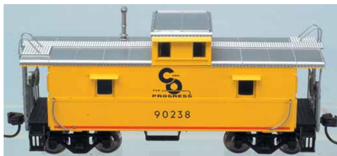
Atlas HO Trainman C & O Style Center Cupola Caboose is available in two numbers each of six road names, and in an undecorated version of the car.

Availability is another aspect that makes these Atlas Trainman products unique. Atlas Trainman items are not seasonal; they will be available on a continuous, year-round basis, allowing dealers to maintain inventory and modelers to add locomotives and rolling stock to their layouts as needed and desired. This is a complete departure