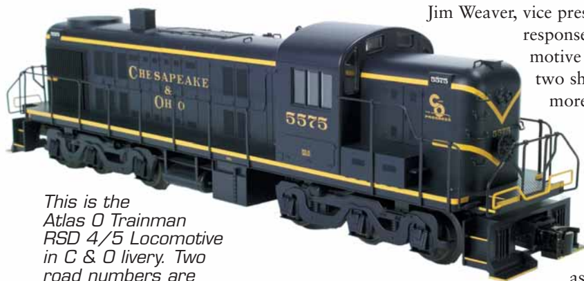
This is the Atlas O Trainman RSD 4/5 Locomotive in C & O livery. Two road numbers are available in each of four road names. This locomotive is offered in 2-rail, 3-rail and 3-rail TMCC versions.

The first shipments of Atlas O Trainman products will be delivered to Atlas distributors and dealers from now through January 2006. The initial Atlas HO Trainman products will also ship between now and January 2006. Secondary shipments for both scales will occur between March and May of 2006. N-scale Trainman shipments will begin in late 2006. Up-to-the-minute product information about trainman products can be found online at www.atlastrainman.com . Check in regularly for updates and surprises. While you're there, take a look at the newest