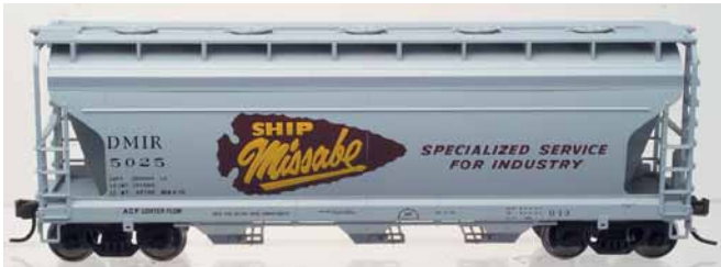
The Atlas HO Trainman ACF 3560 Center Flow Covered Hopper is offered as an undecorated car, and in two road numbers in each of four different road names. Deluth Missabe & Iron Range is shown.

members of the Atlas family, the Trainman, the Trainman Band and their faithful canine companion, Rupert the Trindog. They're all featured in a 45-second musical cartoon on the Atlas Trainman Web site.