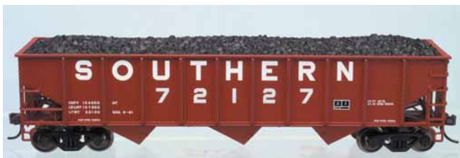
The Atlas HO Trainman AAR 70-Ton 3-Bay Open Hopper is available in four road names, two road numbers each, and in an undecorated version.

Quality combined with value is the hallmark of the Atlas Trainman line, a completely new category of popularly-priced, scale locomotives and rolling stock that's been specifically designed for compatibility with existing layouts. They offer exceptional detail and value for the model railroad dollar. Atlas invites dealers and consumers to see all the value that's been packed into these locomotives and freight cars, and always while keeping the dealer and consumer costs down. Fully assembled and ready-to-run, these units are built for dependability and hours of smooth, reliable performance.