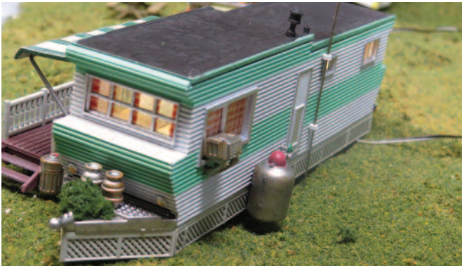
Like all of the trailers, the Grillin' and Chillin' is painted in the light pastel colors of the era it is meant to represent. Of note is how the details extend to all four sides. In this photo the back side of the trailer is shown and it includes many details such as the window airconditioner.